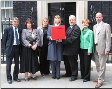
Petition being presented at Downing Street

On Wednesday 20 May, a delegation of campaigners and MP's presented a petition of over 22,000 signatures to 10 Downing Street calling on the government for funding for asbestos cancer research in the UK.