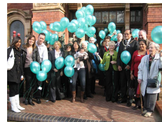
One of the events marking Action Mesothelioma Day 2009

I hope this is agreeable to everyone and Mesothelioma UK will look forward to communicating far and wide events and activities that take place around the country to mark this