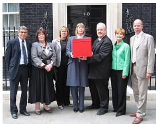
Petition being presented at Downing Street

On Wednesday 20 May, a delegation of campaigners and MP's presented a petition of over 22,000 signatures to 10 Downing Street calling on the government for funding for asbestos cancer research in the UK.