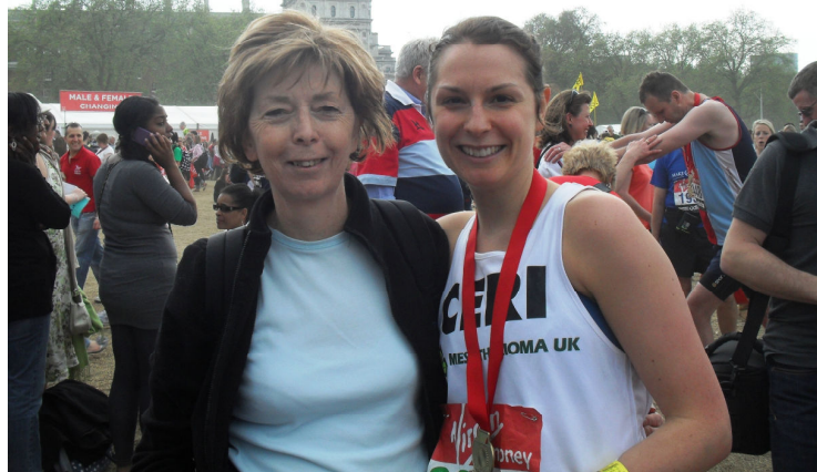
Mum and me at the finish in St James' Park

I'd almost forgotten it was my birthday, and once I'd picked up my bags and found my friends and family I was treated to an embarrassing rendition of Happy Birthday – I loved every second of it. Everyone was telling me I looked so fresh and at that moment I actually didn't feel too bad. The human body really is an amazing machine!